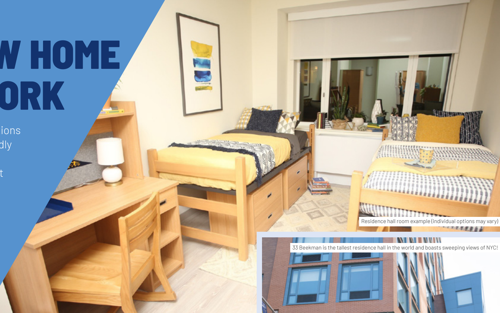
33 Beekman is the tallest residence hall in the world and boasts sweeping views of NYC!