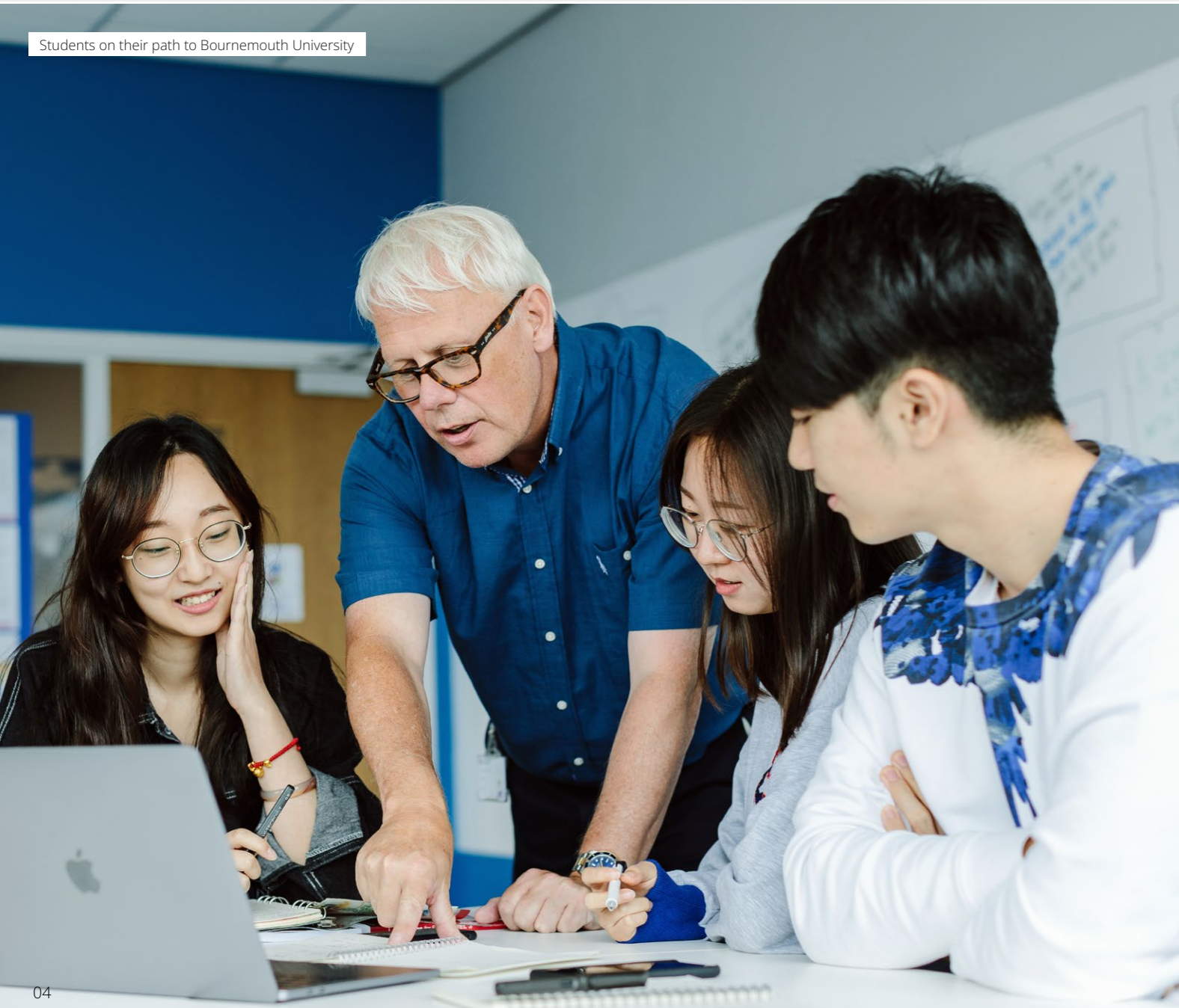
Students on their path to Bournemouth University

Flexible visa options for students: for pathway courses that are 6 months long or less, even if students study in the UK, they don't necessarily need a Student visa. Instead, they can choose to study with Standard Visitor permission, which some nationalities can apply for on arrival. Please check any travel and arrival requirements for both the Student visa and Standard Visitor permission for each of your students, so that they know what to expect before coming to the UK.