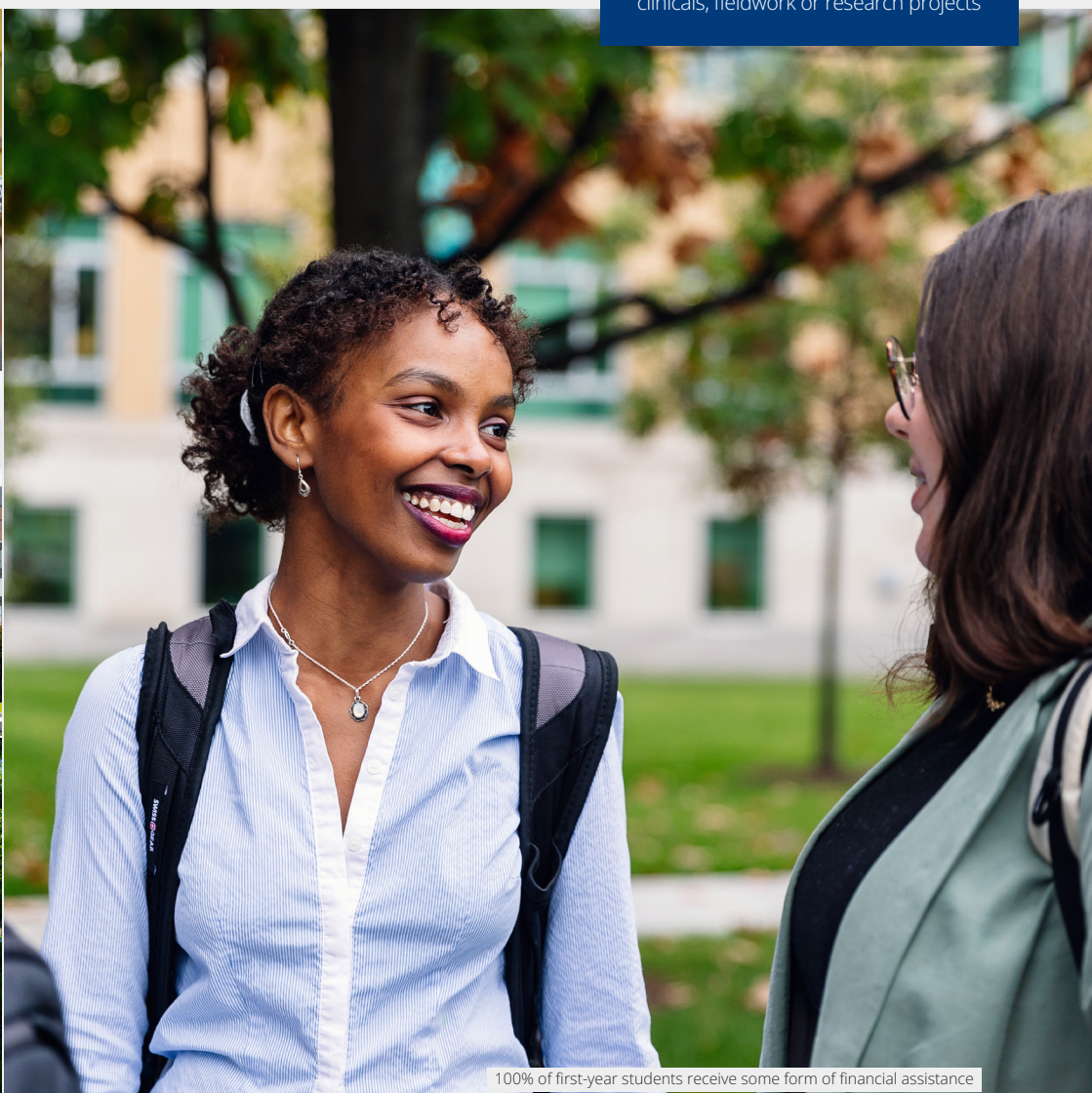
100% of first-year students receive some form of financial assistance