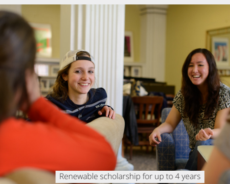
Renewable scholarship for up to 4 years

of students complete internships, clinicals, fieldwork or research projects