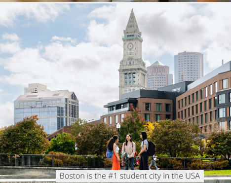
Boston is the #1 student city in the USA