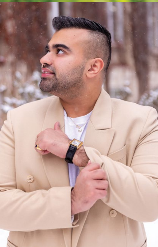
Arts students outside the Humanities building at the U of A.