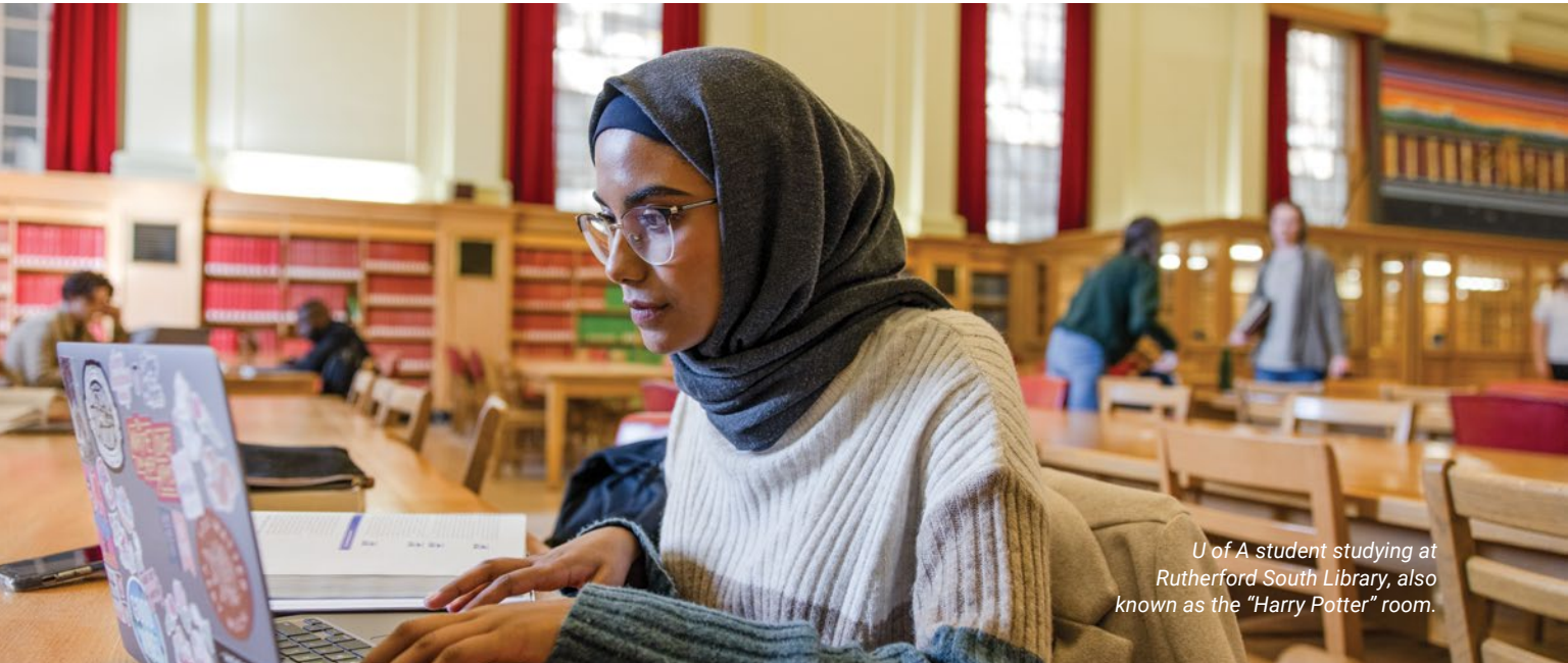
U of A student studying at Rutherford South Library, also known as the "Harry Potter" room.