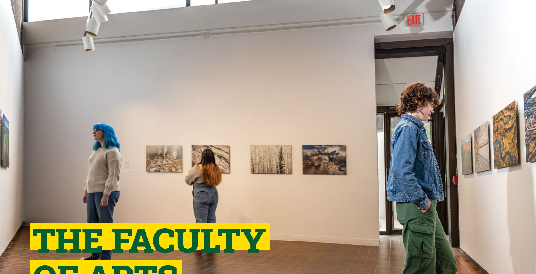
Arts students viewing an exhibition at the U of A FAB Gallery, located in the Fine Arts Building.