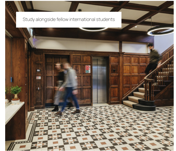
Study alongside fellow international students

This creates a learning environment where you can really thrive, while also expanding your knowledge of other cultures to aid your personal development. The staff at the BIA are there to make your time as a pathway student as fulfilling as possible. You will benefit from world-class teaching from University of Birmingham academics, as well as the BIA's dedicated Wellbeing team who are there to ensure your wider university experience is the best it can be, and just as rewarding as your studies.