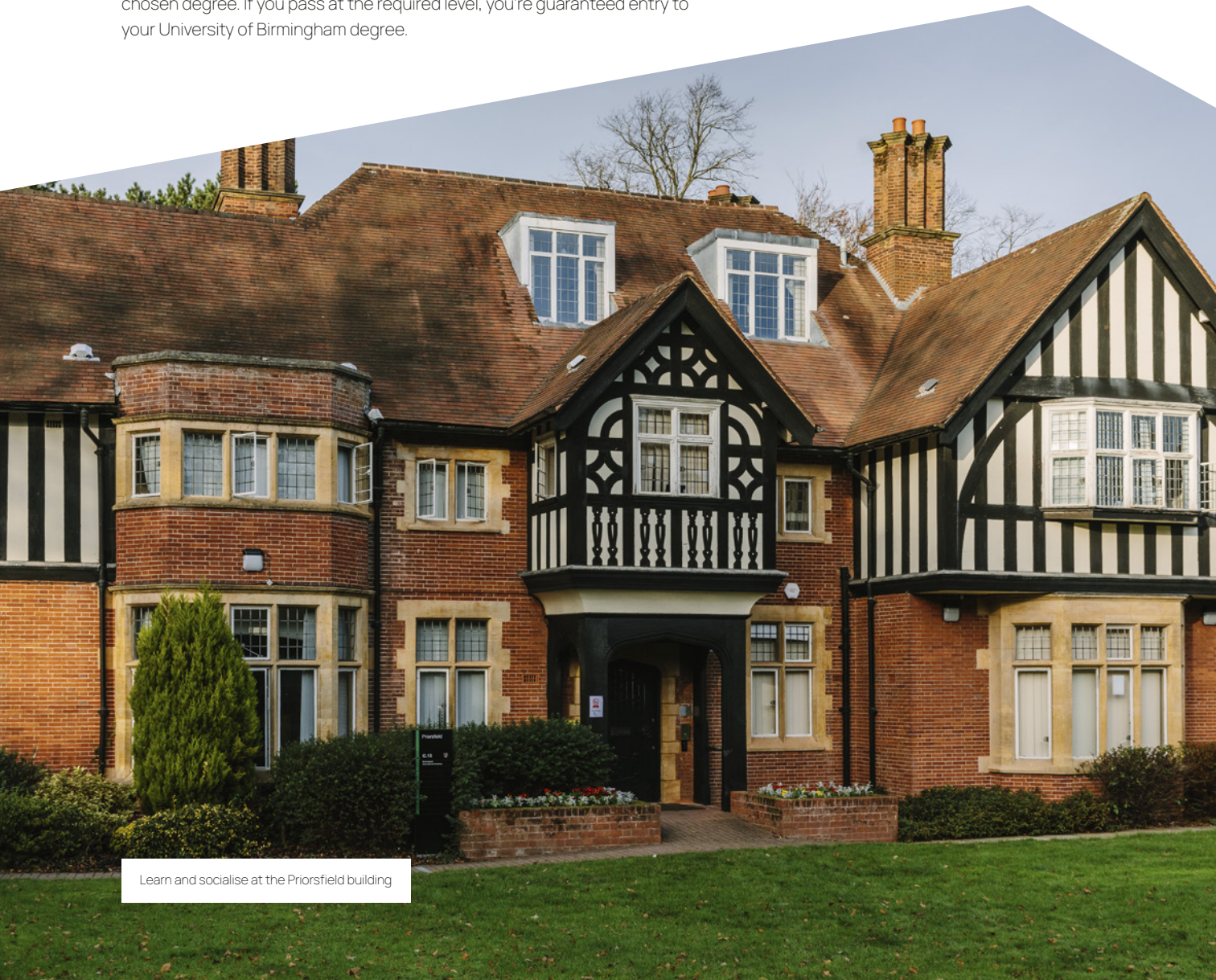
Learn and socialise at the Priorsfield building

The University of Birmingham's foundation pathways are University-delivered courses, designed to fully prepare you for your undergraduate degree at the University of Birmingham. Your pathway course will help you to develop your subject knowledge, English language level and academic skills to meet the entry requirements for your chosen degree. If you pass at the required level, you're guaranteed entry to your University of Birmingham degree.