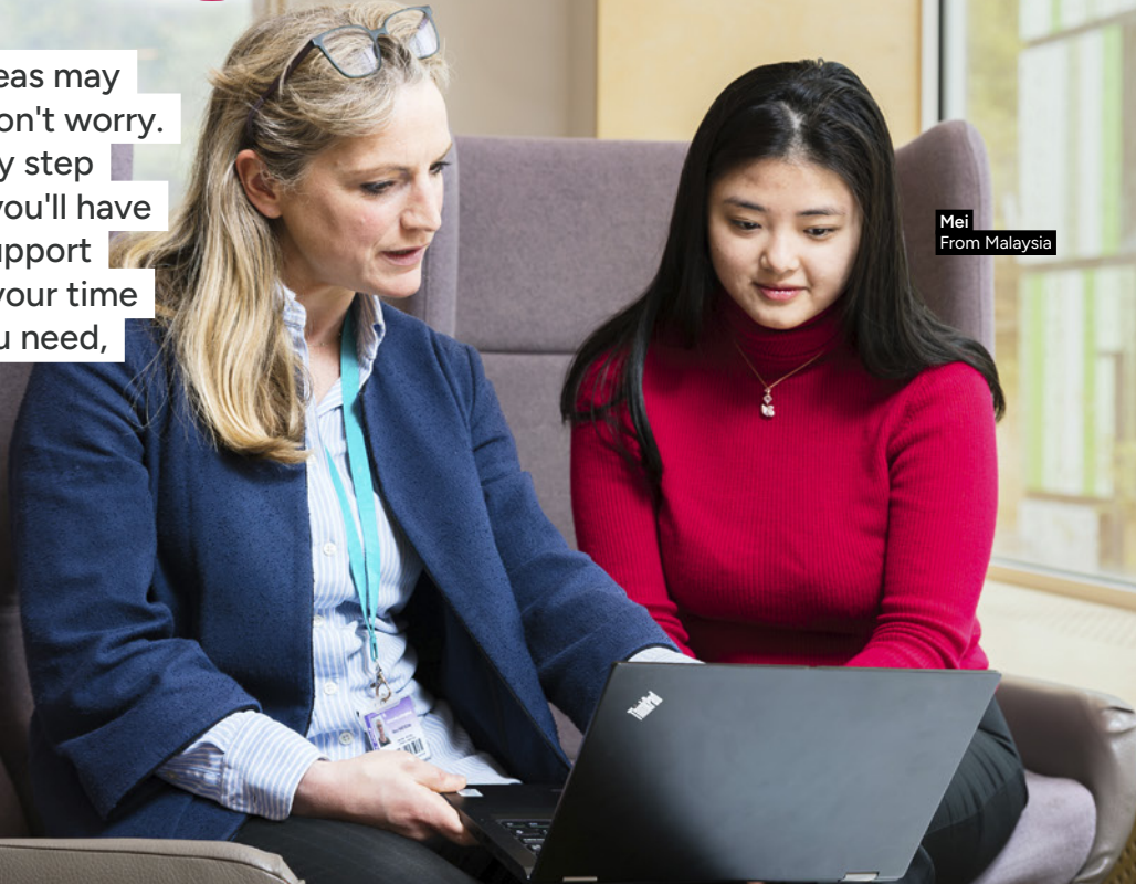
Mei From Malaysia

Going to study overseas may seem daunting, but don't worry. We'll help you at every step of your journey, and you'll have access to fantastic support services throughout your time with us. Whatever you need, just ask.