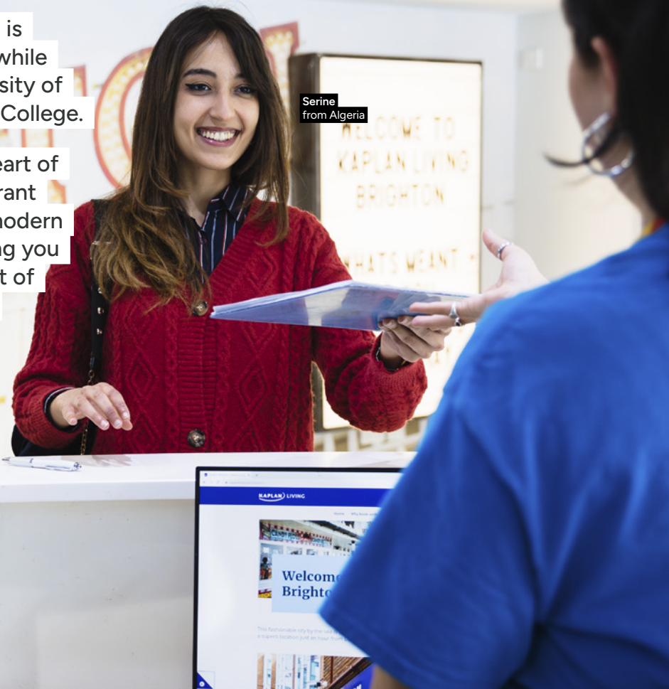
Serine from Algeria

Located right in the heart of the city, it offers a vibrant student community, modern facilities and everything you need to make the most of your time in Brighton.