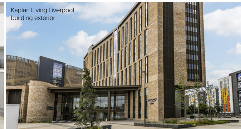
Kaplan Living Liverpool building exterior