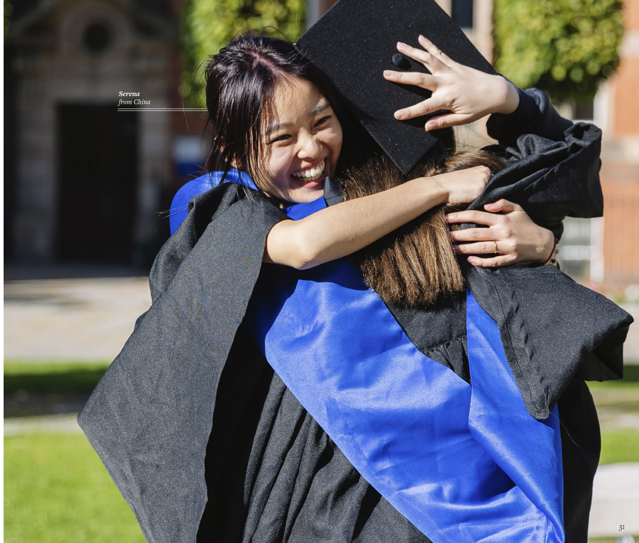
Serena from China

kaplanpathways.com/liverpool-course-info