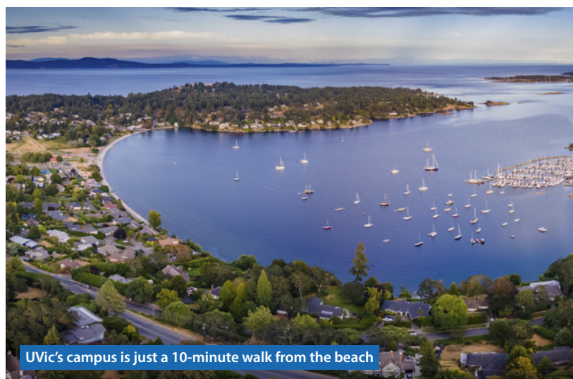
UVic's campus is just a 10-minute walk from the beach