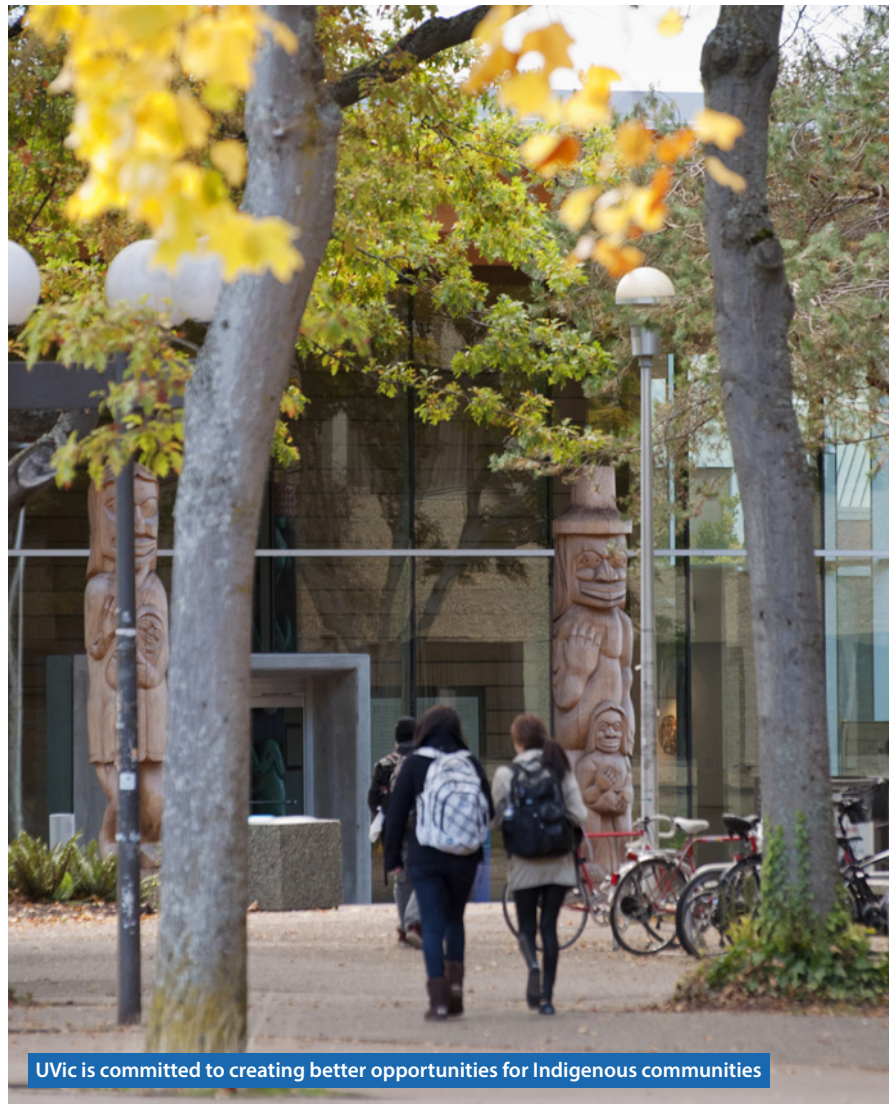
UVic is committed to creating better opportunities for Indigenous communities

24 food kiosks and 21 residences across campus