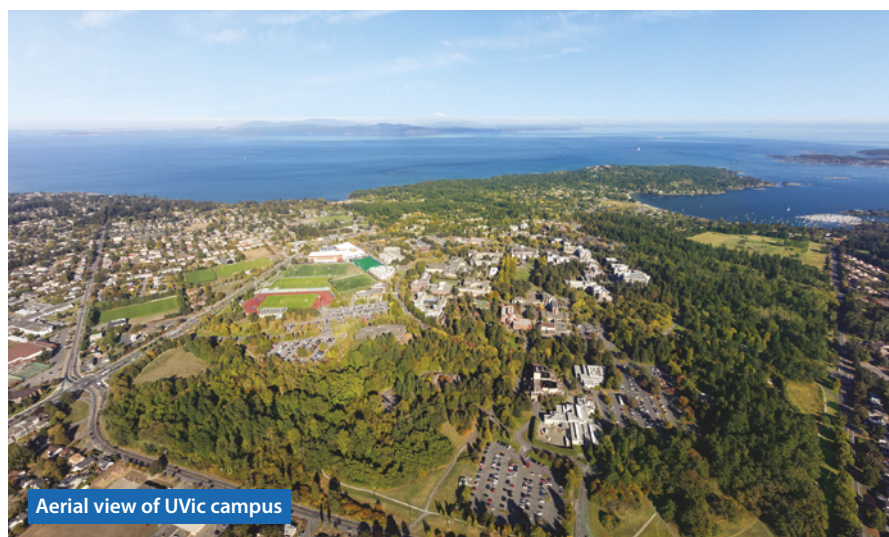
Aerial view of UVic campus