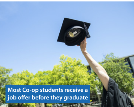
Most Co-op students receive a job offer before they graduate

71% of all eligible undergraduate students do at least one Co-op work term