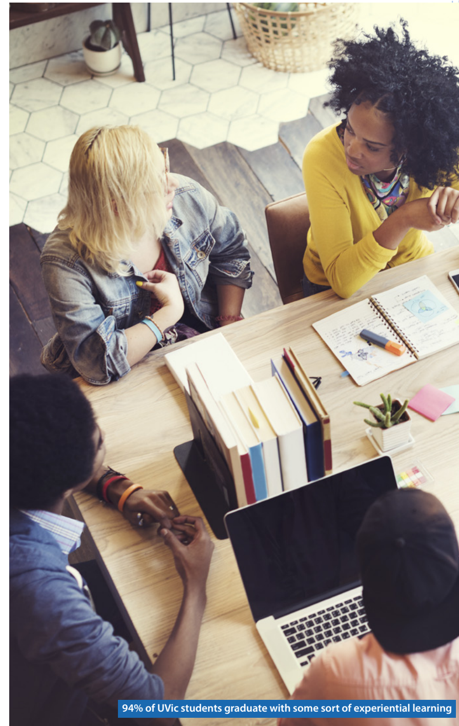
94% of UVic students graduate with some sort of experiential learning

After completing your degree program, you may be eligible to apply for a Post-Graduation Work Permit (PGWP) that allows you to live and work in Canada for up to three years. With international student-friendly programs like PGWP, it's no surprise that Canada ranks as the #1 country for starting a career (U.S. News & World Report 2023).