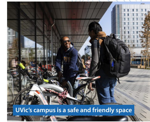
UVic's campus is a safe and friendly space