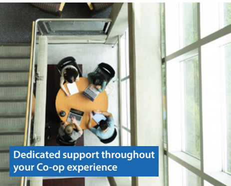
Dedicated support throughout your Co-op experience