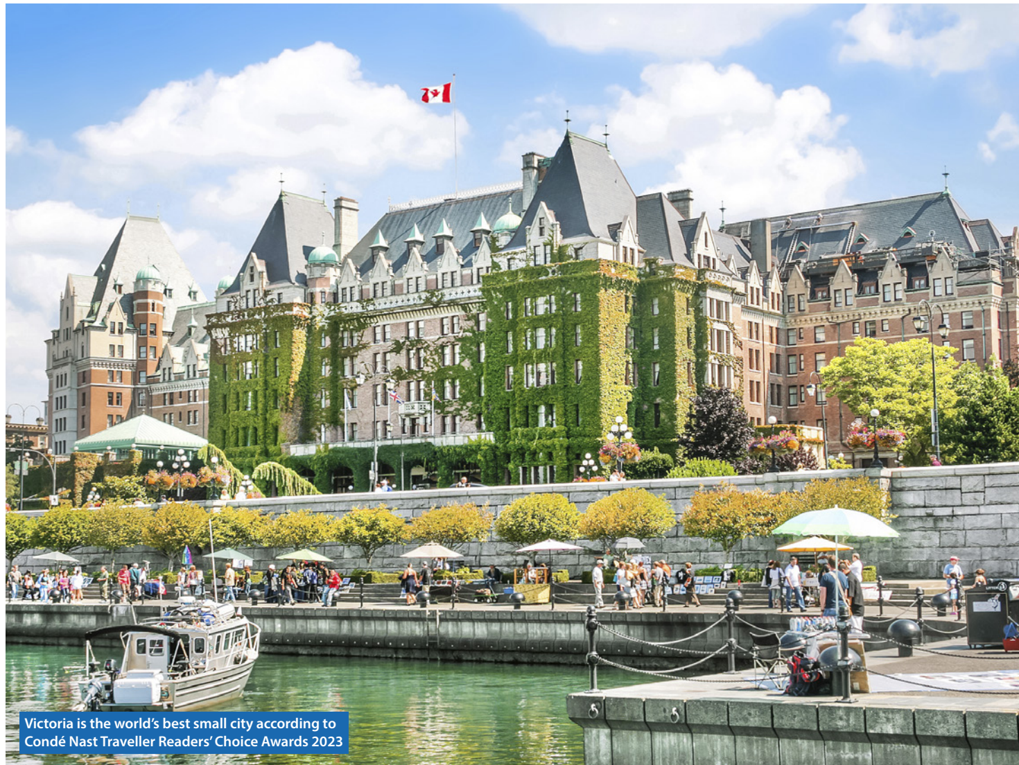
Victoria is the world's best small city according to Condé Nast Traveller Readers' Choice Awards 2023

Magnificent landscapes with four distinct seasons