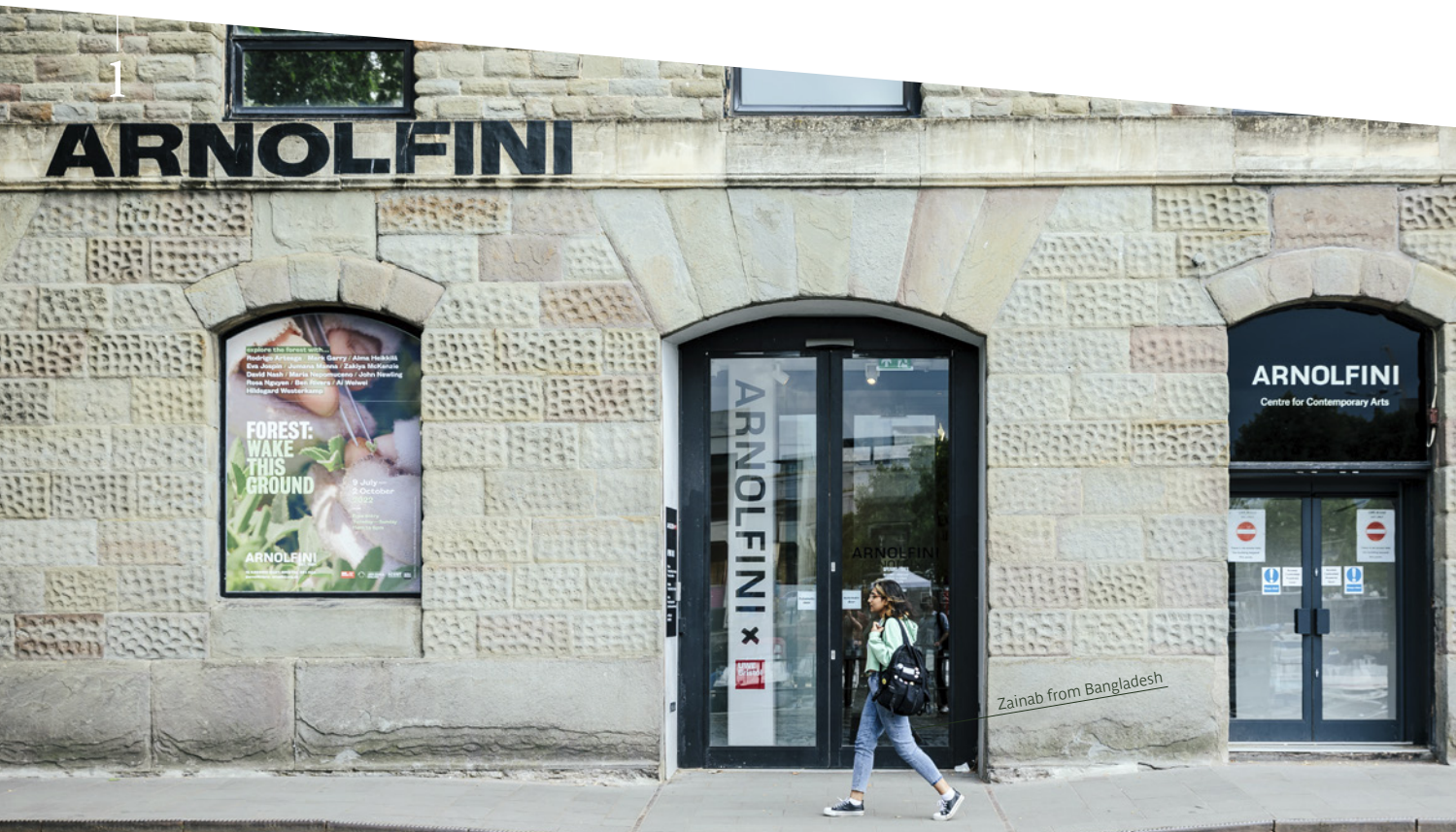
Zainab from Bangladesh

From cutting-edge art to historical exhibits, Bristol's museums and galleries come in all shapes and sizes, showcasing wonderful art and fascinating history. You can also check out the city's famous street art: there are even guided tours dedicated to it.